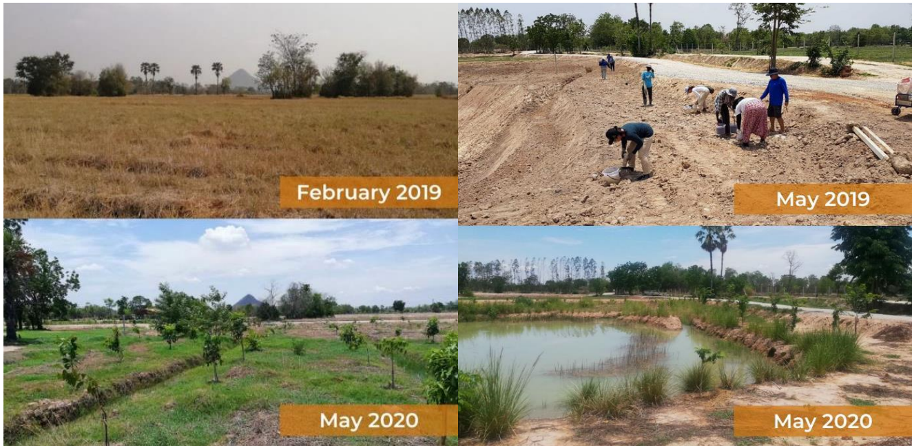
Examples for ecosystem restoration from Ecosystem Restoration Camp Uthai Forest in Thailand